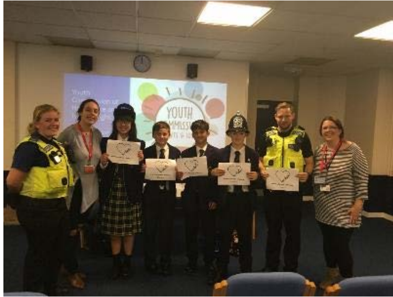
St. John's College